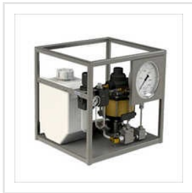
Air Operated Power Pack Bolt Tensioner