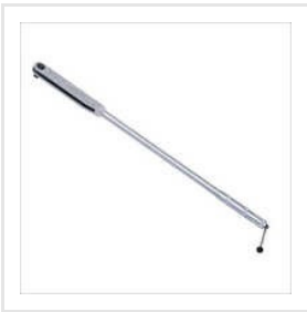
Preset Production Type Torque Wrench