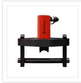
TFS Hydraulic Flange Spreader