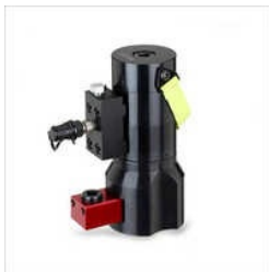
MULTI STAGE BOLT TENSIONER

Air Operated Power Pack Bolt Tensioner, Aluminum Alloy Torque Wrench, Battery Operated Torque Wrench, Bolt Hydraulic Tensioner, Cold Cutting Machine, Digital Angular Electric Torque Wrench, Double Speed Pneumatic Torque Wrench, Electric Shear Wrench, Electric Torque Wrench, High Pressure Hose Wire, Hydraulic Bolt Tensioner, Hydraulic Cable Cutter, Hydraulic Flange Spreader, Hydraulic Jacks and Cylinders, Hydraulic Round Nut, etc.