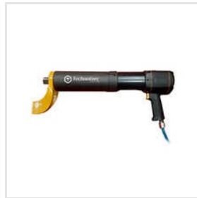
Pneumatic Torque Wrench