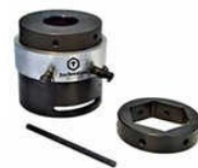
HYDRAULIC BOLT TENSIONER