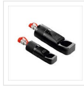
Single Acting Hydraulic Nut Splitter