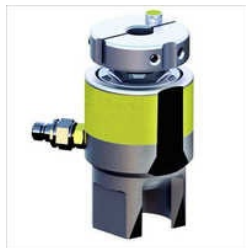
SUB SEA BOLT TENSIONER