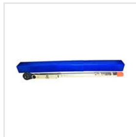
Manual Torque Wrench