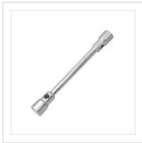
Tommy Spanner Type Slugging Wrench