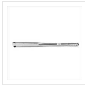
Aluminum Alloy Torque Wrench