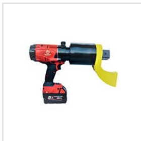
Battery Operated Torque Wrench