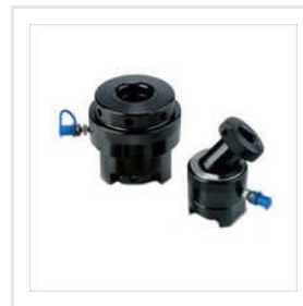
Bolt Hydraulic Tensioner