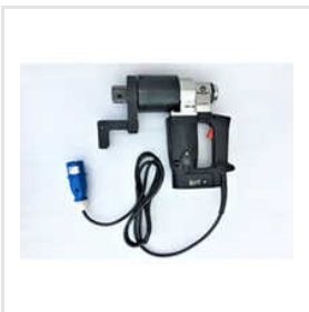
Electric Torque Wrench