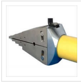
Manual Flange Spreader