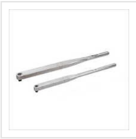
Ultra Light Weight Aluminum Alloy