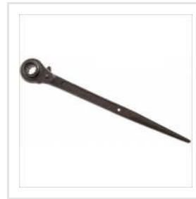
Podger Spanner Type Slugging Wrench