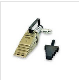
Hydraulic Flange Spreader